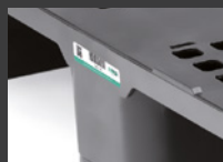
RFID, EAN tags