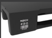
QR, EAN printing and coding