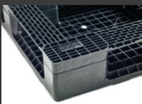
Anti-slip runner bands